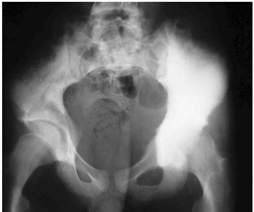
Fig. 4 Tight hamstrings syndrome, Ewing's sarcoma of the left iliac bone, X-ray of the pelvis anterior to posterior

“Lendenstrecksteife” as well as “fixed lumbar lordosis” is applied in the German literature [6, 9, 12]. “Tight hamstring syndrome” associated with spondylolisthesis was used by Phalen and Dickson in 1960 [13]. Martens et al. [10] used the same term and described various underlying pathologies. However, the described clinical